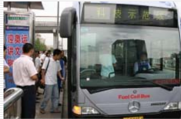
Passengers get on Fuel Cell Bus

The project is linked with “the national scientific and technical development plan for 2005-2020”. And to promote the “Green Olympic 2008”, new generation battery-powered buses are being operated in Beijing now.