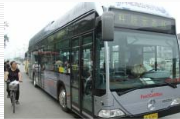
FCB Driving on Road